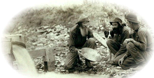
Gold panning then (c. 1889)